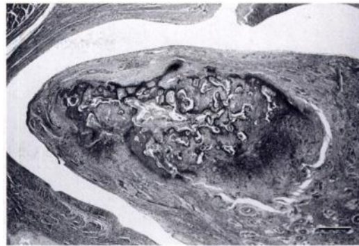
FIGURE 2. A cartilaginous nodule with osseous metaplasia located in the synovial membrane of the great horned owl's scapulohumeral joint. H&E. Bar = 200 \mu\text{m} .

Synovial chondromatosis is characterized by the formation of multiple, benign cartilaginous nodules in the synovium. It is believed to be a reactive process of unknown origin (Fechner and Mills, 1992). When the majority of these nodules undergo bony transformation, the term osteochondromatosis is used. In humans, most cases involve the knee; however, there are separate reports involving the joints of the shoulder, carpal and tarsal bones, ankle, and mandible (Fechner and