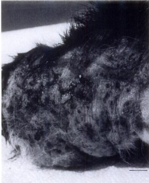
FIGURE 1. Photograph of alopecic area of skin on the dorsal aspect of the head of a striped skunk infected with Filaria taxideae showing the multifocal hemorrhagic crusts resulting from filarial dermatitis. Bar = 1.4 cm.

heart, lung, liver, spleen, kidney, stomach, intestine, pancreas, and brain were fixed in neutral buffered 10% formalin, embedded in paraffin, sectioned at 5 \mu m, and stained with hematoxylin and eosin (H&E) for histologic examination. Aseptically collected swabs of cutaneous abscesses were submitted to the Athens Diagnostic Laboratory (Athens, Georgia, USA) for aerobic bacterial culture according to standard bacteriologic techniques (Ikram and Hill, 1991). Briefly, swabs were streaked onto 5% sheep blood agar plates directly and after overnight enrichment in thioglycolate broth at 37 C. Inoculated plates were incubated at 37 C, and bacterial colonies identified visually and via testing with an o-nitrophenyl- \beta -d-galactopyranoside disc (Becton Dickinson & Co., Rutherford, New Jersey, USA). Sections of the cerebrum including hippocampus were submitted to the same laboratory for fluorescent antibody testing for rabies virus (Veleca and Forrester, 1981).