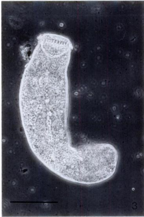
FIGURE 3. Wet mount of metacercaria dissected from cyst. Note the single row of circumoral spines. Bar = 100 \mu\text{m} .

filament epithelium in some areas did lead to fusion of gill lamellae and loss of respiratory surface (Fig. 5). Noga (1996) indicated that while metacercariae usually are innocuous and cause little harm, they can affect organ function if they displace sufficient host tissue. Additionally, the characteristic lack of substantial host response to metacercariae is probably due to cyst formation by the parasite.