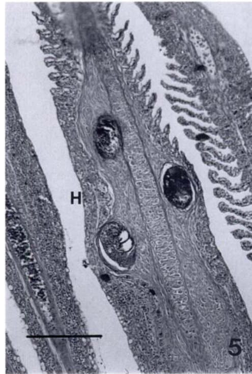
FIGURE 5. Histological section of gill filament of steelhead trout with cartilagenous gill rod and adjacent metacercarial cysts. Note extensive hyperplasia of filament epithelium (H) and fusion of lamellae. Wheatley's modified Gomari trichrome stain. Bar = 200 \mu m.

The unequivocal assignment of the steelhead trout metacercariae to trematode family was not possible based upon observable characteristics of the larval trematodes. It was not possible to distinguish between the families, Heterophyidae or Cryptogonimidae, based upon cumulative morphological evidence. These characteristics included small size, spinose epidermis, circumoral spines, presence of a pre-pharynx and a small ventral sucker. Characteristics that suggested an affinity of these metacercariae with the family Heterophyidae included the above characters, general size and shape, and especially that they located specifically in the cartilage of the gill filaments where they were associated with proliferation of cartilage cells. The steelhead metacercariae differed from the heterophyid genera noted above in the number of circumoral spines. The parasites in steelhead have a single row of 29 to 32 spines; A. angrense has an anterior row of 16 to 18 and a posterior accessory dorsal row of two to three spines (Sogandares-Bernal and Lumsden, 1963); P. spindalis has a single row of 14 (Martin, 1964); and C. formosanus has a double row of 30