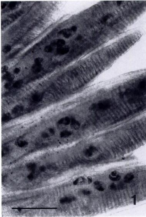
FIGURE 1. Wet mount of gill filaments of steelhead trout with metacercarial cysts. Bar = 500 \mu\text{m} .