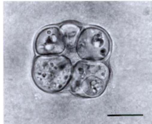
FIGURE 2. Sphaerule of Mucor amphibiorum containing daughter sphaerules from crush preparation of granuloma in liver of Litoria caerulea . Unstained. Bar = 10 \mu m.

tents. Sphaerules ranged in size from 5.1 to 26.0 \mu m diameter ( n = 50 ) with all mother sphaerules having a diameter >12 \mu m ( n = 10 ). The internal structure of sphaerules varied, being either homogeneous or granular or consisting of daughter sphaerules. The organisms stained strongly with PAS and methenamine silver stain.