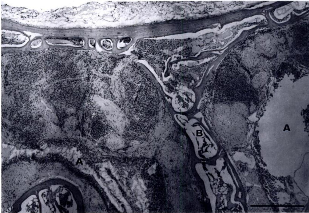
FIGURE 3. Section of nasal cavity of Litoria caerulea . The airways are largely obstructed by fibrous tissue and granulomatous inflammation which also has spread into the bone marrow; A = airway; B = bone marrow within nasal septum. H&E. Bar = 500 \mu m.

in the other toad. Although only two cane toads of unknown disease status were inoculated in our experiment, we suspect the infection was transmitted experimentally as the prevalence of M. amphibiorum among free-ranging cane toads is <1% (Speare et al., 1994).