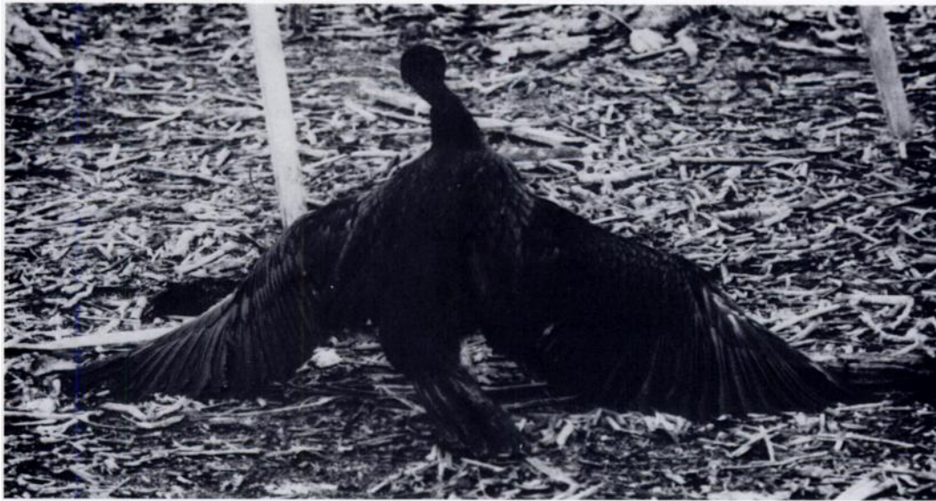
FIGURE 3. Double-crested cormorant with bilateral leg paralysis due to Newcastle disease. It is trying to move forward by use of its wings pivoted against the ground, and is leaning on the ground with its tail.

wings, tail, or both. They were capable of flying and swimming, but were unable to dive. They often rested in sternal recumbency, whereas normal cormorants usually rest standing. Cormorants with bilateral leg paralysis sometimes showed knuckling