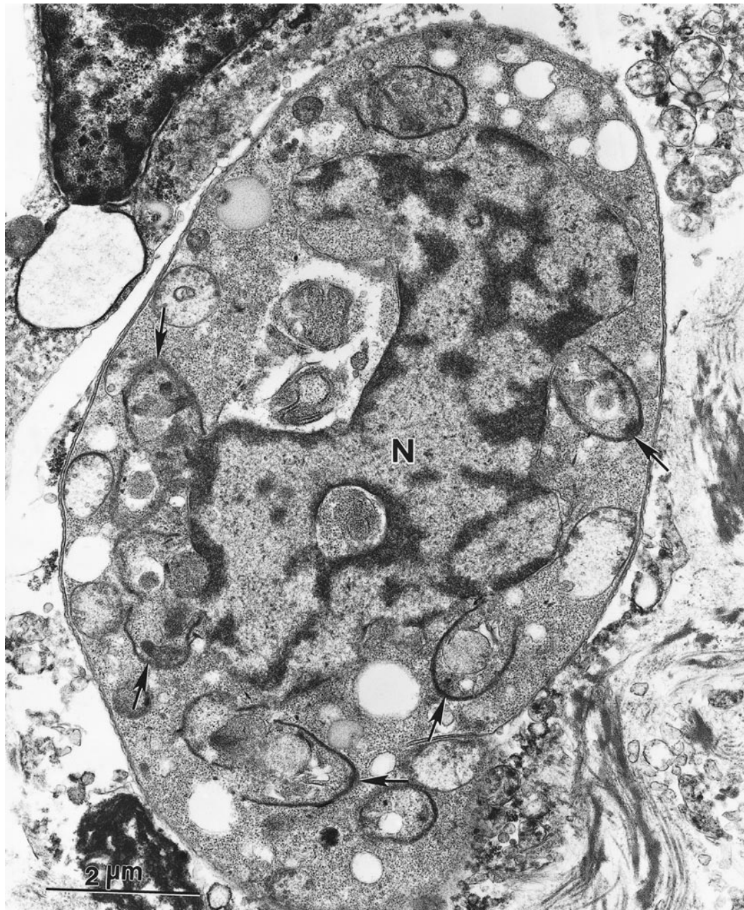
FIGURE 2. Transmission electron micrograph of an immature schizont of Sarcocystis sp. from a wild turkey with multilobed nucleus (N) and merozoite analagen (arrows).

Mississippi, Missouri, North Carolina, Puerto Rico, South Carolina, Tennessee, Virginia, and West Virginia. Funds were provided by the Federal Aid to Wildlife Restoration Act (50 Stat. 917) and through Grant Agreement 1445-GT09-96-0002,