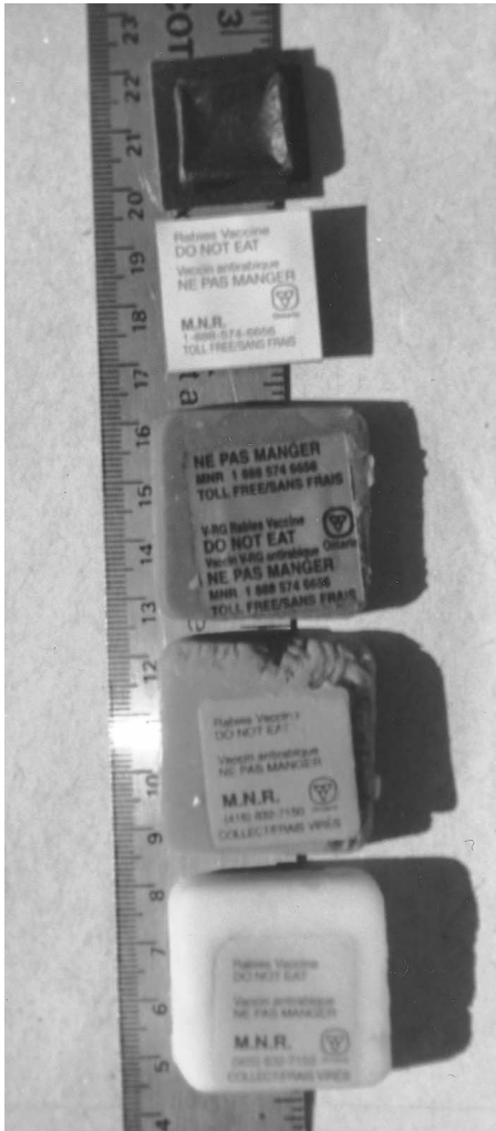
FIGURE 1. Photograph (from top to bottom) of a Sugar Vanilla bait (SV), a cheese bait (CH), a small Sugar Vanilla bait (Sml SV), an SV and a sml SV bait (showing the difference in thickness of baits) and flocked blister packs that contain liquid vaccine.

coons in urban habitats are very sedentary (raccoon movements would not bias the results). One to 3 wk post baiting, raccoons were live-captured (Tomahawk model 106 and 108; Tomahawk Live-Trap Co., Tomahawk, Wisconsin, USA), immobilized (20–30 mg ketamine hydrochloride), ear-tagged for identification, vaccinated against rabies with a 1 ml intramuscular injection of Imrab inactivated rabies vaccine (Rhone-Merieux, Athens, Georgia, USA), a first premolar tooth collected, and