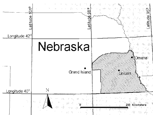
FIGURE 1. Escherichia coli O157:H7 investigation in free-ranging deer in Nebraska. The hatched area in southeastern Nebraska denotes the area from which hunters submitted fecal samples from harvested deer.

During the regular firearm season of 1998 (November 14–22), hunters collected fecal samples from deer harvested in the Blue and Wahoo Management Units of southeastern Nebraska, USA. Nebraska deer hunters are required by the Nebraska Game and Parks Com-