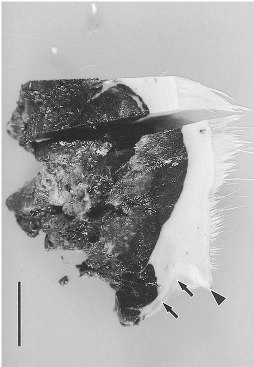
FIGURE 1. Marginal part of eyelid with tumor. Formalin-fixed sample. The tumor mass was black and firm. The tumor protruded to the palpebral conjunctiva (arrows) and ruptured. The palpebral skin and meibomian glands (arrowhead) were intact. Bar = 1 cm.