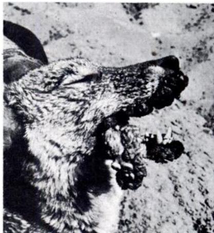
FIGURE 1. Gross lesions of coyote oral papillomatosis illustrating involvement of the tongue and oral mucosa.

Histopathologically, this tumor was epithelial and resembled the canine oral papilloma (Smith and Jones, Veterinary Pathology, Lea and Febiger. 422, 1966). The bulk of the papilloma was made up of thick papilliform growths of stratified squamous epithelium covering and supported by thin, delicate filiform branches of connective tissue from the dermis, containing blood vessels and leukocytes (Fig. 3). The epithelial overgrowth was covered by a heavy layer of cornified epithelium (Fig. 3), a classical feature of canine papillomatosis. Many of the squamous cells below the cornified layer