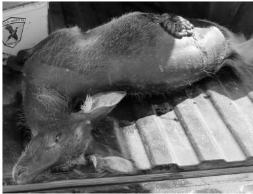
FIGURE 1. White-tailed deer fawn with congenital hypotrichosis collected from eastern South Dakota in October 2001.

ductules were empty or contained sloughed cells admixed with amphophilic to pale basophilic, globular to fibular material. In some sections, widely scattered hair follicles with normal hair-root bulbs extended into the deep dermis. These hair follicles appeared in various stages of hair development. Arrector pili muscles were usually readily evident and appeared to insert near the base of the dilated follicles. Variable sebaceous gland hypertrophy and hyperplasia was present in all sections examined.