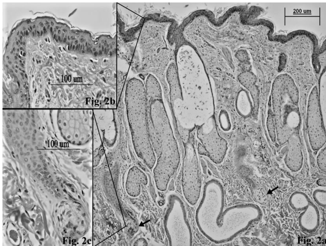
FIGURE 2. Skin section from scapular region of hypotrichosis fawn. (a) Note ectatic follicles, hyperplastic and hypertrophic sebaceous glands, ectatic apocrine glands, and abnormal hair bulbs (see arrows). H&E, 100 \times . (b) Note melanin pigment in deep layers of epidermis. H&E, 400 \times . (c) Abnormal hair follicle development from hypotrichosis fawn. Note cluster of spindloid cells associated with follicle squamous cells. H&E, 400 \times .

The epidermis of the fawn was mildly thickened (orthokeratotic hyperkeratosis and mild acanthosis). Melanin pigment was prominent within deep layers of the epidermis of the hairless fawn (Fig. 2b) compared with an age-matched normal