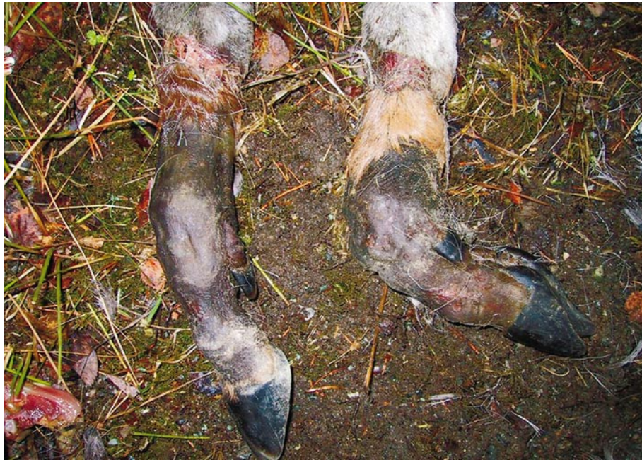
FIGURE 1. Moose calf (no. 3) showing bilateral gangrene of the hind limbs extending up to the distal third of the metatarsus. There is discoloration and loss of hair in the necrotic skin, and separation of the skin between necrotic and viable areas. Rims of unshed brown calf haircoat are seen distal to the separation zone.