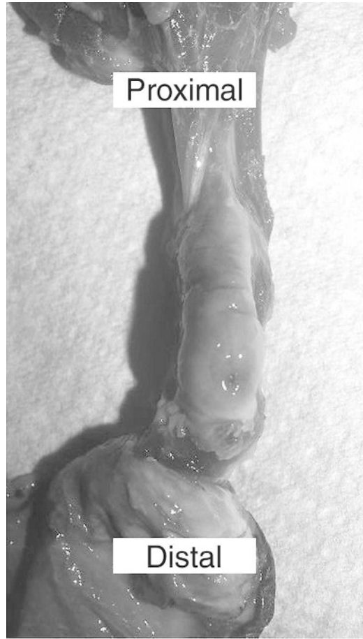
FIGURE 1. Necropsy specimen of the right hind limb of an eastern box turtle ( Terrapene carolina ). The skin is reflected distally to expose a subcutaneous mass. Note the small opening and pigmentation in the caudodistal portion of the capsule, as well as edema.

At necropsy, the right hind limb was swollen with a palpably firm subcutaneous mass surrounding the right proximal tibia. The third and fourth digits were absent from the right hind limb. Subcutaneously, a 3 cm \times 1 cm encapsulated mass extended distally along the caudal aspect of the right tibia. A subcutaneous adhesion was associated with the mass on the caudolateral aspect of the right midtibia where a remnant of suture material was present. The capsule was filled with dark brown-black, friable necrotic material (Fig. 1). The liver was diffusely pale, and a black