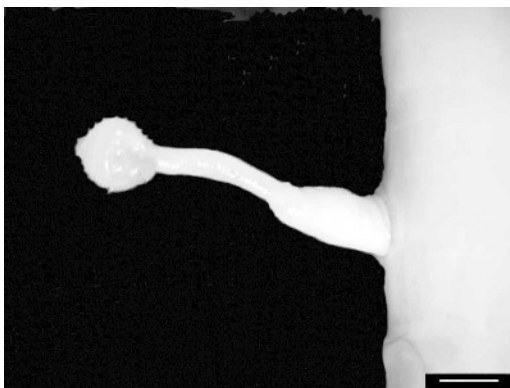
FIGURE 2. External view of small intestine perforated by a single acanthocephalan. Bar=800 \mu m.

associated with a thin cap of intact intestinal serosa as the only remaining barrier between the intestinal lumen, the transmural parasite, and the coelom. The