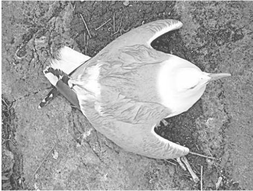
FIGURE 2. A Herring Gull ( Larus argentatus ) from Blekinge, Sweden with clinical signs of botulism. The wings are dropped at the shoulder and have fallen away from the body. The bird is alert.

2004, and 27 affected Herring Gulls and four affected Great Black-backed Gulls from the Blekinge archipelago collected from 2000 to 2003 (Table 1). A capture ELISA method was followed as outlined in Rocke et al. (1998).