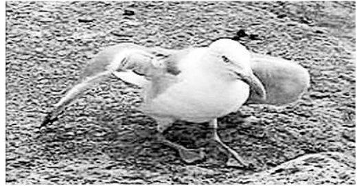
FIGURE 3. A Herring Gull ( Larus argentatus ) from Blekinge, Sweden with clinical signs of botulism. The bird was unable to stand fully upright and stood and walked on its tarsometarsi.

Affected birds displayed a range of progressively developing neurologic signs, with limb paresis to complete paralysis being the most consistent finding. Initially, gulls showed delayed or uncoordinated flight compared to normal conspecifics when approached. Two such individuals were observed in the field, but escaped