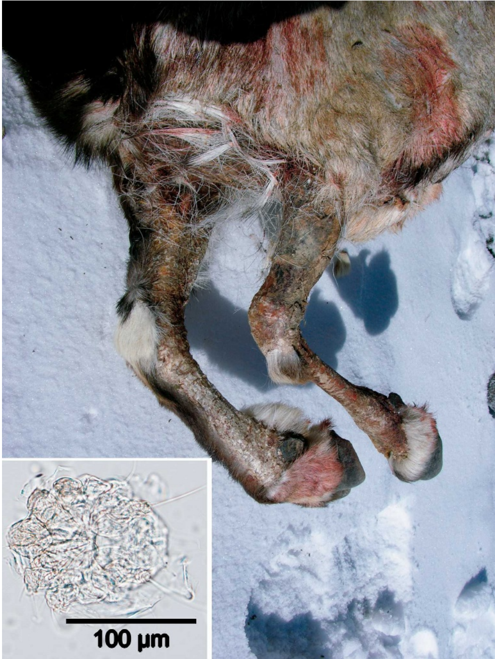
FIGURE 1. Forelegs and brisket of the affected blue sheep. Note alopecia, marked lichenification and grey scaling crust present on the surfaces of both forelegs from the elbows to the carpi, both axillae, and the brisket. Insert: mite recovered from plucked hair preparation with morphology typical of Sarcoptes scabiei .

sheep adapted to mountain terrain in North Africa) following their introduction to the Sierra Espuña Regional Park in Spain, there was a total absence of lesions