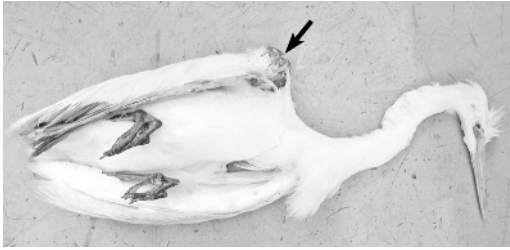
FIGURE 1. Great Egret with large mass on the right carpal joint (arrow).

titis caused by unidentified trematodes, pulmonary congestion, a foreign-body granuloma in the muscular layer of the small intestine and microfilariae in peripheral blood (no adult filarid worms were detected). There was no evidence of metastasis of the neoplasm in any organ.