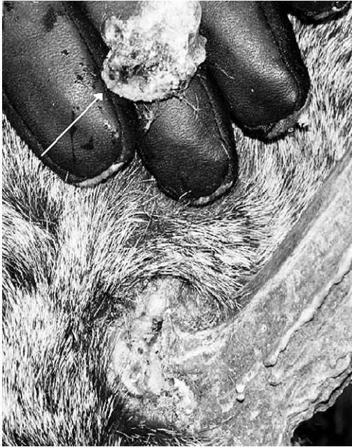
FIGURE 2. Exudate on the antler pedicle of 4.5-yr-old male white-tailed deer at Chesapeake Farms, Maryland, USA, 2006. Note the skull fragment that split away from the antler pedicle.

Maryland, USA, deer were positive for A. pyogenes . Other bacteria identified included Staphylococcus ( n=6 ), Bacillus ( n=4 ), Klebsiella ( n=1 ), and Pseudomonas ( n=1 ; Davidson et al., 1990; Baumann et al., 2001). Eighty percent ( n=4 ) of the A. pyogenes results came from the nasopharyngeal samples. None of the Texas, USA, deer cultured positive for A. pyogenes . Other bacteria identified from Texas, USA, samples included Staphylococcus ( n=8 ) and Bacillus ( n=9 ). The failure to culture A. pyogenes from nasopharyngeal or antler base swabs suggests that presence of this organism associated with intracranial abscessation may be limited at our Texas, USA, site. It is possible the arid climate may discourage growth of A. pyogenes ; however, our study design does not specifically address this question.