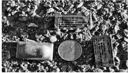
FIGURE 1. Photo of ONRAB ® rabies vaccine-baits.

Here, we report on field trials designed to determine the efficacy of AdRG1.3, hereafter called ONRAB ® , in baits, for immunizing free-ranging skunks and raccoons against rabies in SW Ontario. The