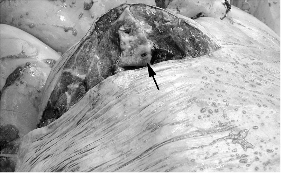
FIGURE 1. A transverse cut through an unencapsulated tuberculosis granuloma in the dorsocaudal lobe of the left lung, ~40 mm in diameter. Bar=1.5 cm.