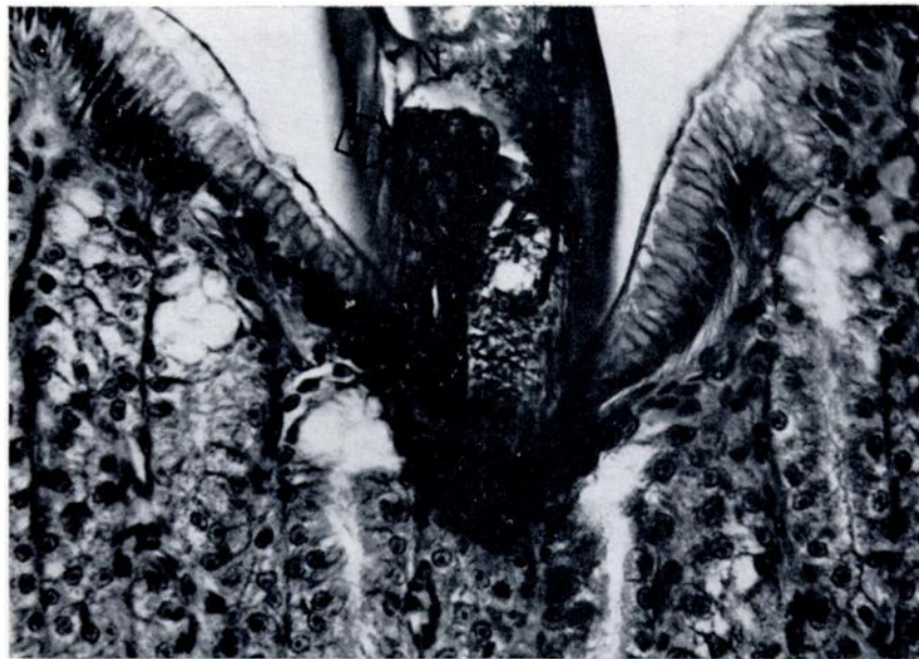
FIGURE 2. Third-stage Physaloptera larva at edge of tubular mucosal lesion. Note oral glands (arrow) anterior to the nerve ring (N). x 425.