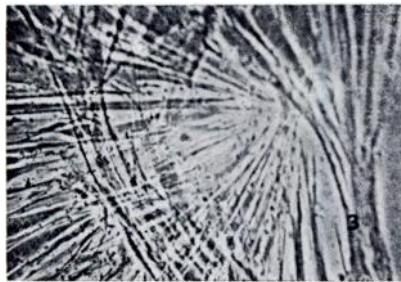
FIGURE 3. Cells from lung of gray seal — 2 months in culture.