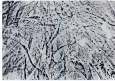
FIGURE 2. Cells from mesentery of dolphin — 1 month in culture.