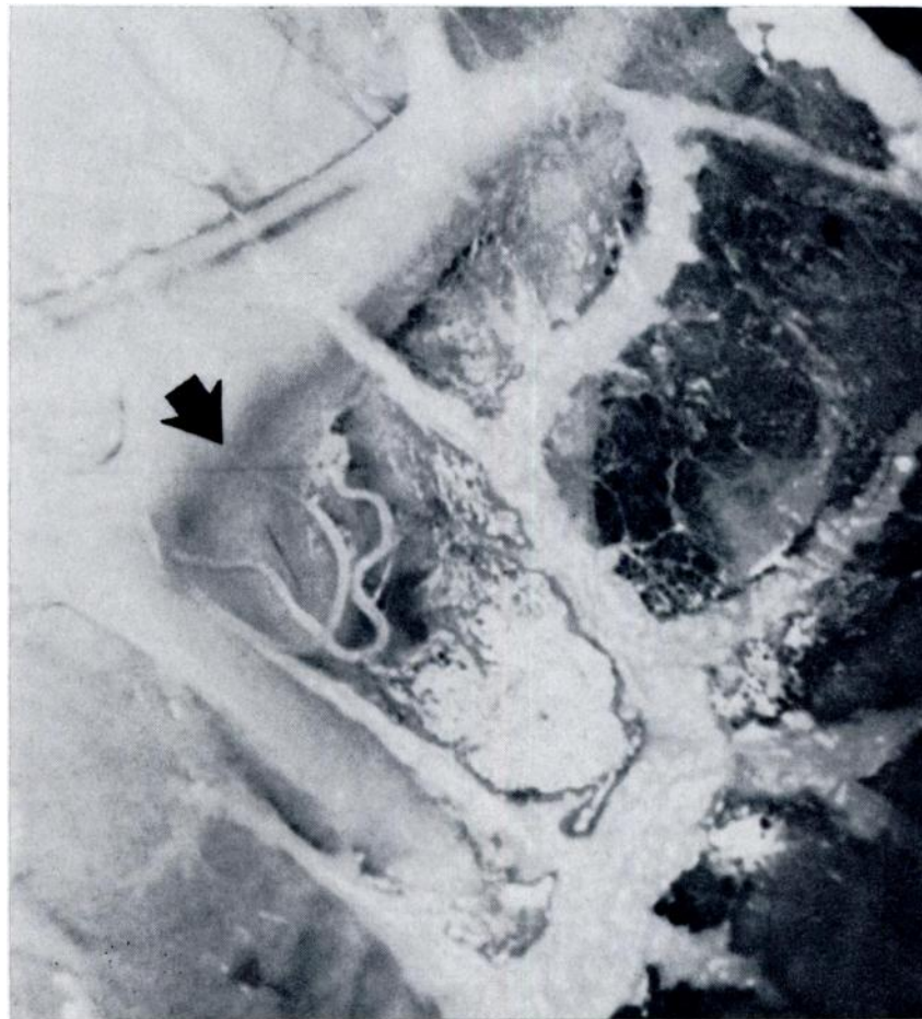
2. Adult Setaria in situ near rumen of reindeer.