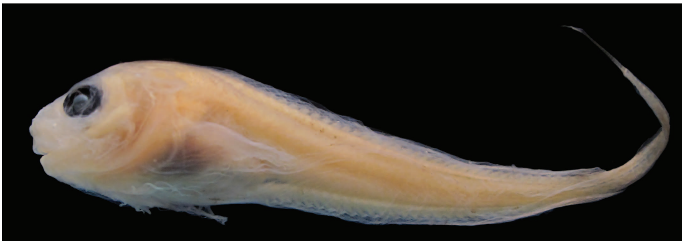
Fig. 1. Careproctus canusocius , new species, holotype, UAM 47901, 81.0 mm SL, Beaufort Sea, U.S.–Canada Transboundary waters, photographed after preservation.

Description. —Body slender, tapering posteriorly to slender tail, moderately compressed, depth at dorsal-fin origin 77.7 (72.8) % HL. Head moderately large, moderately depressed, slightly swollen nape, dorsal profile gradually sloping from nape to snout. Snout rounded, projecting beyond upper jaw. Mouth inferior, moderate in size, maxilla 52.6 (42.6) % HL,