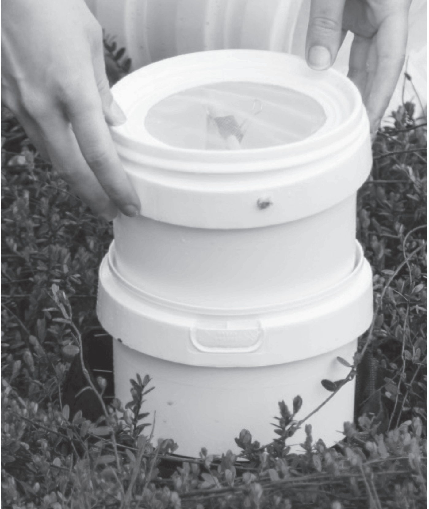
Fig. 1. Bucket-type emergence trap seated into cranberry field. Inner bucket with mesh lid is descending into support bucket.

Emergence traps were tested in 2015 on 6 cranberry farms in Pitt Meadows (49.3833°N, 122.2333°W) and Langley (49.2666°N,