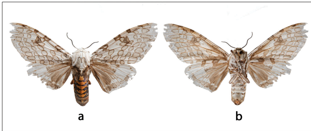
Fig. 3: Eclosed female of Hypercompe cunigunda (Stoll, 1781) from Suriname. a : dorsal view; b : ventral view.