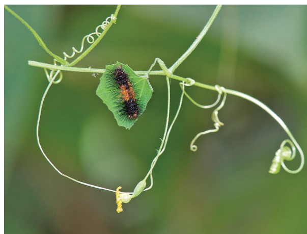
FIG. 1: Antepenultimate instar of Hypercompe cunigunda (Stoll, 1781) on Melothria pendula L. (Cucurbitaceae), Colakreek, Suriname, 3 March 2014. Note pistillate yellow flower below.

Antepenultimate instar (Fig. 1, Fig. 2a, b). Head : vertices and frons black, no spines or scoli; light gray line over coronal sulcus and upper one-fourth of adfrontal sulci; clypeus light gray, upper border convex; labrum dirty yellow with in upper half a semicircular