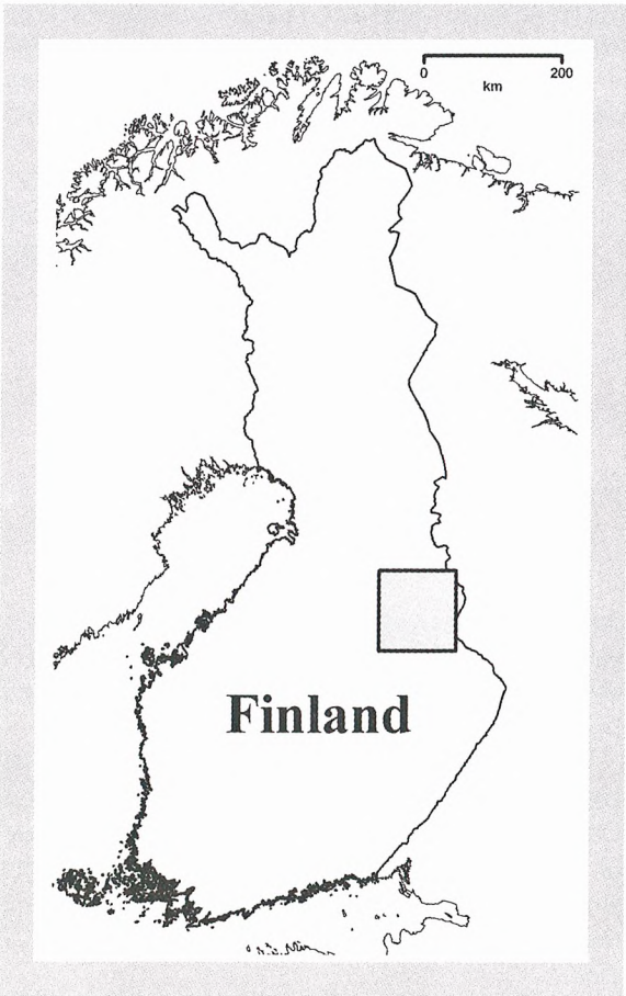
Figure 1. Location of the study area in east-central Finland where six wolf territories were examined during 1999–2001.

We performed our study in east-central Finland (Fig. 1) during 1999–2001. The study area is mostly comprised of exploited coniferous forests dominated by Scots