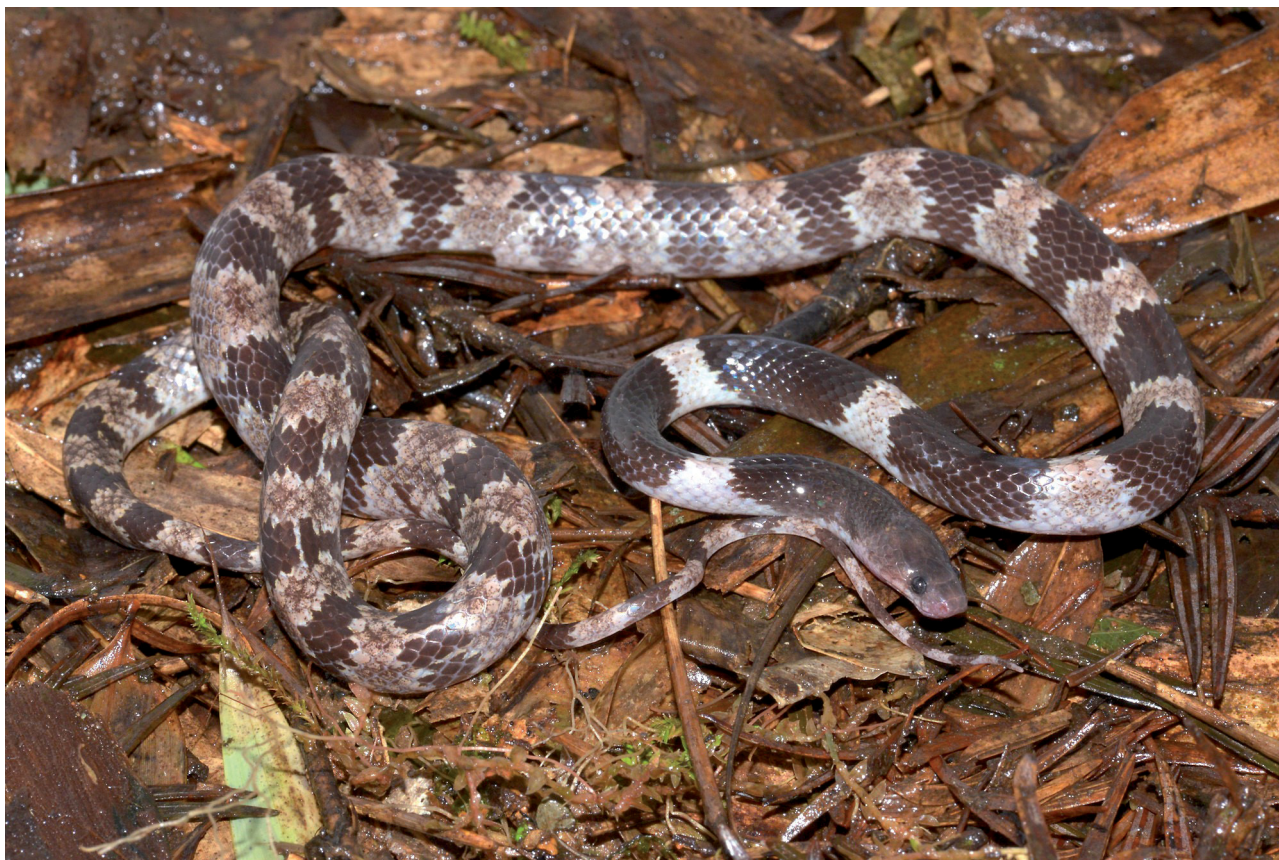
Fig. 2. New country record of Lycodon pictus (CIB 115609) from China (Nonggang, Guangxi), adult female in life.

Coloration in preservative: Dorsal surface of head and neck with pigmentation, paler on lateral side of head, the lower part of supralabials yellowish cream, speckled