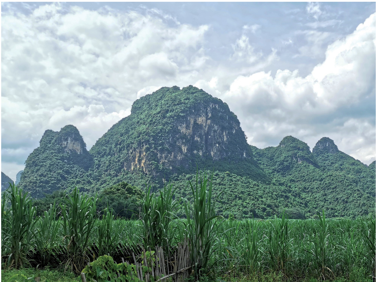
Fig. 5. Macrohabitat of Lycodon pictus in Nonggang National Nature Reserve, Longzhou, Guangxi, China.

The holotype of Lycodon pictus (IEBR 4166) could be genetically confirmed. The newly discovered specimen from the site close to the type locality in northern