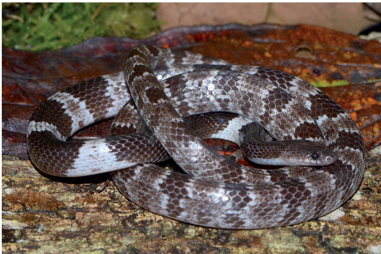
Fig. 1. The new record of Lycodon pictus (VNMN 011227) from Vietnam in life.

New record for Vietnam (n = 1): VNMN 011227 (Fig. 1), Ha Lang, Cao Bang, Vietnam, Coordinates 22°42'50" N, 106°40'74" E, 960 m a.s.l., collected by Nguyen Quoc Huy on 18 May 2019.