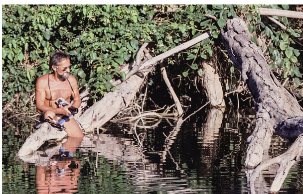
Volker Mahnert in photo-ambush for fish gasping for air in Paraguay.

one of the contestants dropped out of the race much too early. Nevertheless the record is most impressive. Volker Mahnert has published 200 papers on various subjects and on a wide spectrum of animals, including blood-parasitic protozoans, endoparasitic worms and ectoparasitic arthropods, spiders (only peripherally), palpigrades, amphibians, reptilians, fish, mammals and, above all, pseudoscorpions. Two co-operations with close friends can be highlighted: on characiform fish with Jacques Géry (1917-2007) and on Brazilian pseudoscorpions with Joachim U. Adis (1950-2007).