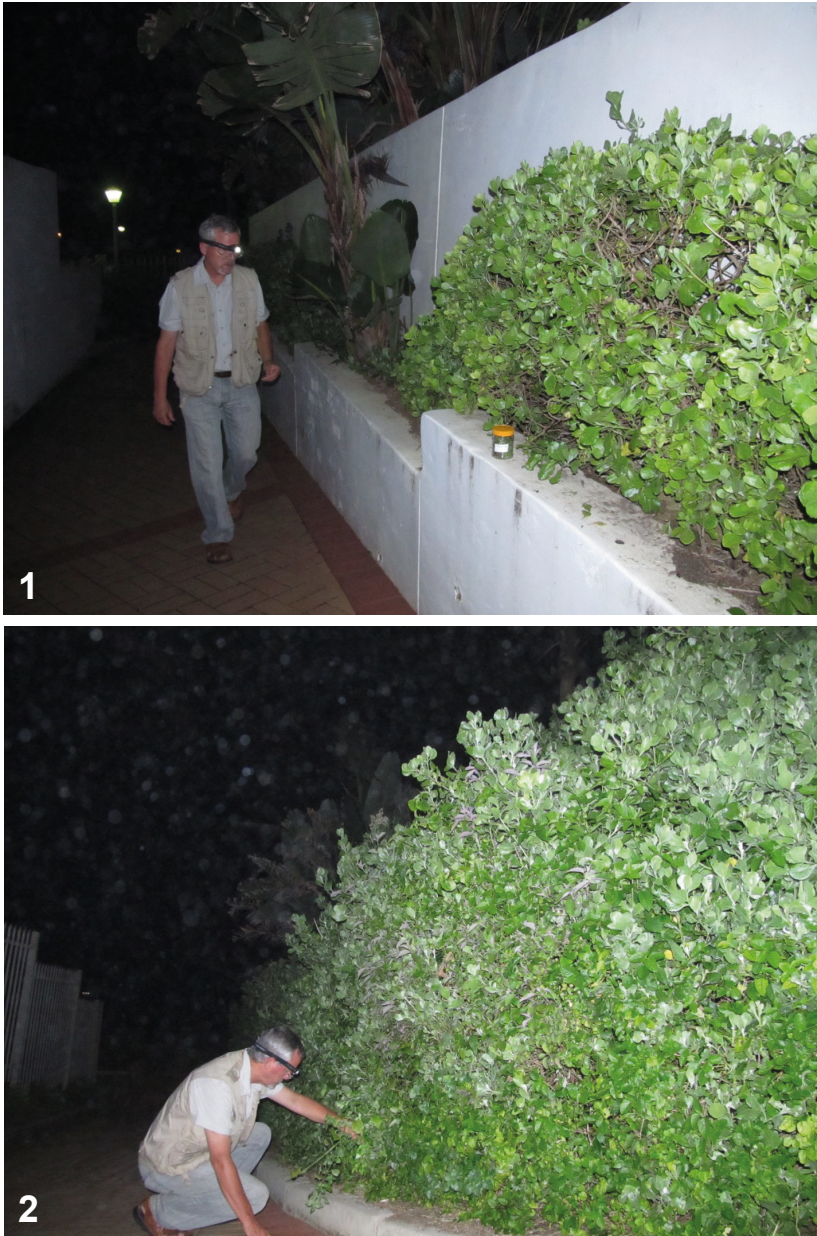
Figs 1, 2. Photographs at night of senior author D.S. Glazier near rows of bietou bushes Chrysanthemoides monilifera rotundata along walkways near The Promenade of Umhlanga beach, South Africa. These are two of the sites where numerous individuals of the isopod Tylos capensis were observed climbing on bietou bushes.

edges), whereas those from Yzerfontein were thicker (more succulent) and more smoothly rounded, thus more closely matching those of the subspecies C. monilifera rotundata observed at our field site in Umhlanga (cf. Weiss et al. 2008). However, the