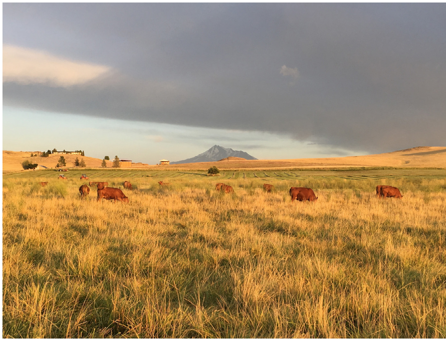
Figure 1. As social-ecological systems, the sustainability and resilience of family ranches and rangelands depends on their ability to adapt to changing conditions across social and ecological scales.

ferent times. We know rangelands are complex, adaptive systems shaped by interlinked ecological and social components (Fig. 1). 2-4 There exists a long, rich history of rangeland research, extension, and education focused on the important biophysical dimensions of these systems. However, although social science research applications within complex rangeland systems have markedly expanded in the past decades, 5,6 there is still significant work to do to fully integrate and leverage the equally important human dimensions. 7-9 So, how do we disrupt the status quo “build it and they will come” approach and move toward authentic engagement with all stakeholders, emphasizing the human dimensions?