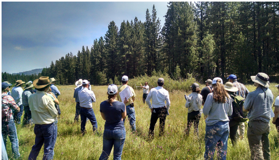
Figure 3. Investing in and training future generations of natural resource professionals, land managers, and scientists to address rangeland management and policy issues through holistic and integrated approaches is critical to building resilient rangeland systems.

around the world. 7,44–48 However, once we gain the perspectives of on-the-ground managers (i.e., asking people what they do), we see agreement, not debate, among research and management communities on the success of rotational grazing, particularly for achieving livestock production goals. Across California and Wyoming ranching communities, we found limited (5%) on-ranch adoption of intensive rotational grazing strategies; however, most (62%) ranchers had adopted extensive rotational strategies with moderate grazing periods and livestock densities. 8 Therefore, we can gain valuable, place-based knowledge by directly engaging with stakeholders and potentially avoiding decades of arguing and, instead, immediately focusing on more vital needs, which is more imperative than ever.