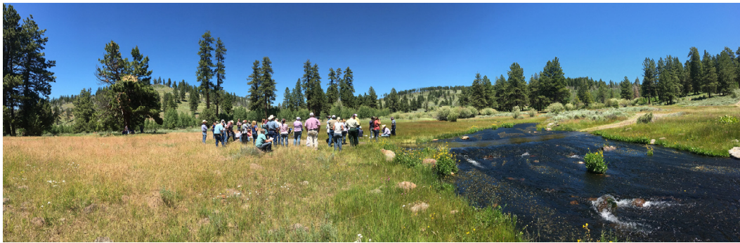
Figure 4. Cross-institutional partnerships can provide important opportunities for students, as well as all members of the rangeland research and resource management communities, to build capacity in developing successful, interdisciplinary science-management collaborations to tackle the wicked problems within rangeland social-ecological systems.

support organizations will be critical to this next generation's success.