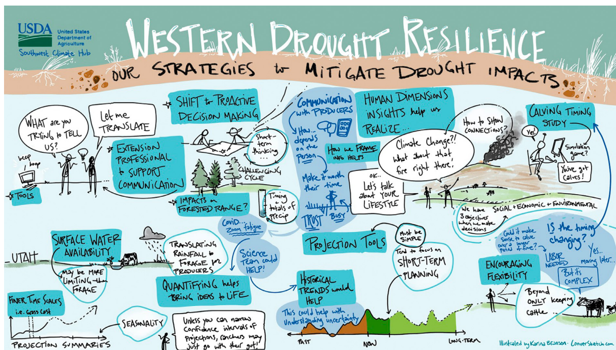
Figure 3. Group discussion captured by graphic illustrator present at the workshop (Karina Branson, ConverSketch).

ature. We walked through the methods for this step, which included examining an inclusive suite of different climate projections, 20-22 as well as quantifying the degree and duration (i.e., exposure) of past and future drought. 23-25 We then presented our results by region to highlight the diversity in drought manifestation. We explained that while temperature is likely to increase across all regions, precipitation and soil moisture display more variability. For instance, we described the northern mixed prairies and cold deserts of the western United States (Fig. 2) will experience an increase in winter and spring soil moisture, although relatively unchanged summer and fall soil moisture. In California's annual rangeland region, we suggested more frequent extreme drought during the winter, but slightly wetter average spring and summer conditions. We explained that spring soil moisture is likely to decline in the hot deserts region, but differ in projections for soil moisture change for other seasons in both the hot deserts and shortgrass steppe.