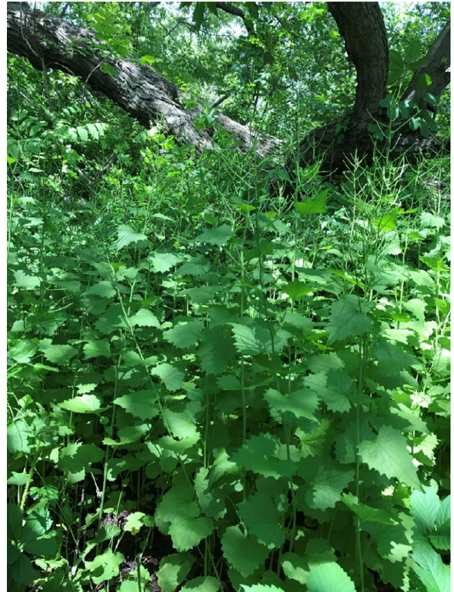
Figure 1. Stage of Alliaria petiolata development during treatment application at all three sites. Petal dehiscence has initiated, and green fruit are present and developing.

The study was conducted at two different locations in Wisconsin (2017 and 2018) and at one location in Illinois (2018). The experiment conducted in 2017 was located near Prairie du Sac (Prairie), WI (43.352°N, 89.758°W), and the experiments conducted in 2018 were located near Fitchburg, WI (43.019°N, 89.454°W), and Dixon Springs, IL, at the Dixon Springs Agricultural Center (Dixon) (37.428°N, 88.664°W). All research sites consisted of forested areas with the understory having at least 75% cover of A. petiolata (Figure 1). Soil types were silt loams at both Wisconsin locations