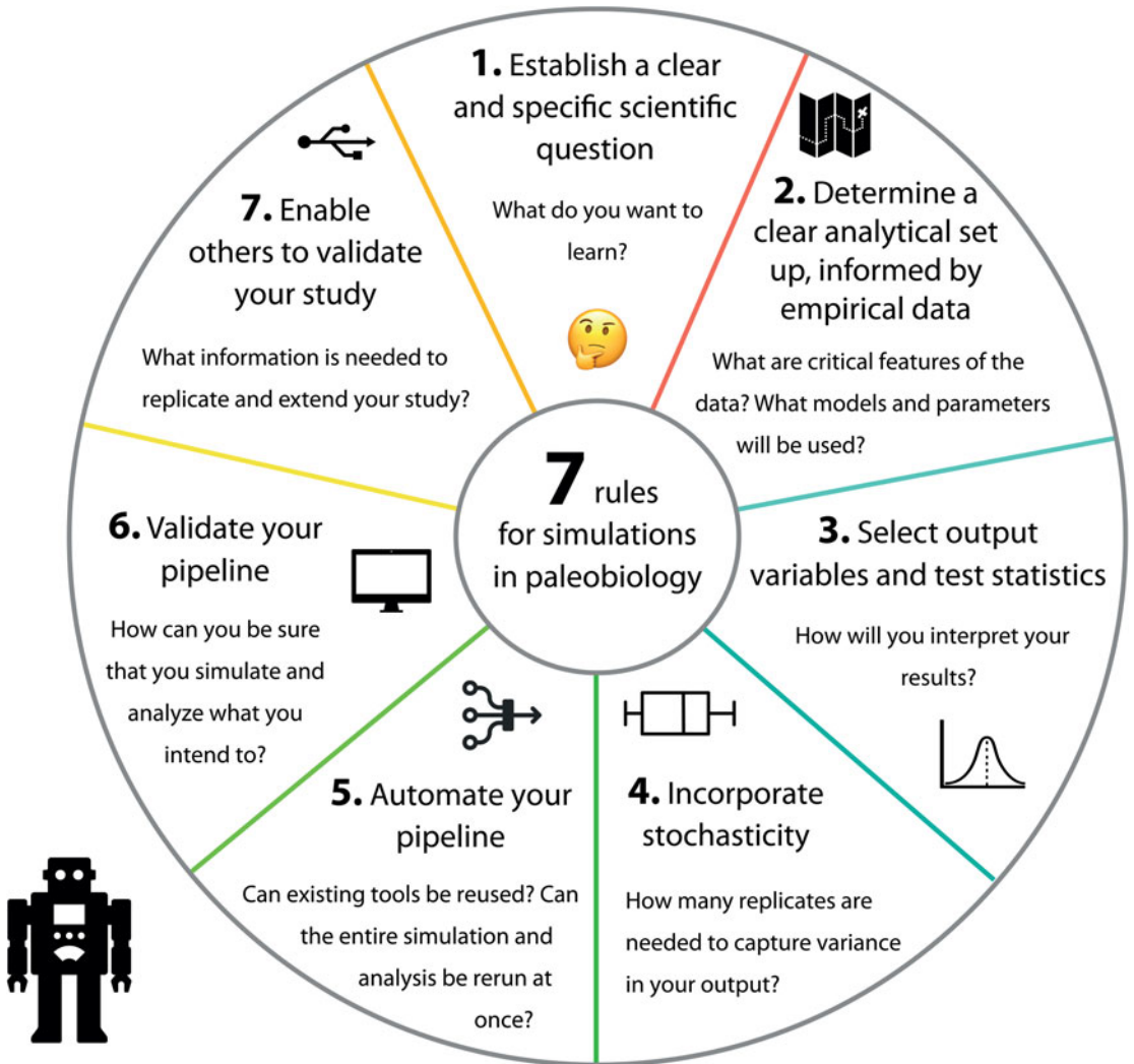
FIGURE 1. Visual summary of our proposed rules for good simulation study design. Each rule is associated with the main question(s) that the rule is designed to address.

case study can illustrate how results apply to real-life scenarios, which can help in communicating the impact or potential application of your results to other researchers. For example, Soul and Friedman (2017) used simulations to identify evolutionary and analytical scenarios that result in biased estimates of phylogenetic clustering of extinction. They then demonstrated the biological implications of their simulation results using an analysis of Mesozoic tetrapods. Similarly, Barido-Sottani et al. (2019a) examined the impact of fossil-age uncertainty in phylogenetic inference, using both simulations and an empirical case study.