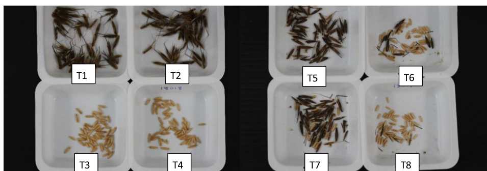
Figure 1. Wild oat seed after scarification. T1 is intact seed with husk (lemma and palea), T2 is punctured seed with husk, T3 is manual extraction of caryopsis plus needle puncture, and T4 is manual extraction of caryopsis. Mechanical scarification treatments are T5: 1,350 rpm for 5 s, T6: 1,500 rpm for 5 s, T7: 1,350 rpm for 10 s, T8: 1,500 rpm for 10 s.