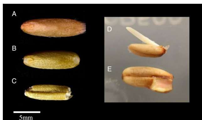
Figure 2. Caryopsis at different levels of seed coat and embryo damage can be observed: (A) intact caryopsis; (B) caryopsis with ideal damage to the seed coat located on the distal part to the embryo where the endosperm is slightly exposed, allowing for water movement to the embryo to trigger germination; (C) the embryo has been destroyed; (D) successful germination after the application of treatment T6 (1,500 rpm for 5 s); (E) imbibed caryopsis which failed to germinate after the application of treatment T8 (1,500 rpm for 10 s).

removal, sandpaper scarification, immersion of the seed in sodium nitroprusside (NO donor SNP) solution, and untreated control (Table 3). These seed germination techniques were applied to population 'e' (Table 1) using the methodology outlined in Table 3. There were three replicates for each treatment (50 seeds each). The experiment was conducted in parallel to Experiment 3 in February 2020 and repeated in August 2020. To validate the germination results, all ungerminated seeds were treated with 2,3,5-triphenyl tetrazolium chloride to assess viability as previously described.