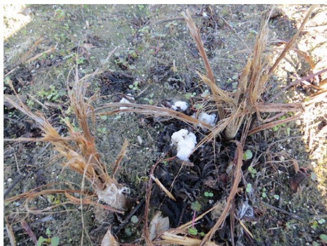
Figure 6. Stalk regrowth of 2,4-D-resistant cotton after shredding and treatment with duplosan.

countries in Asia, farmers in the United States rely solely on dry-seeded or water-seeded establishment techniques.