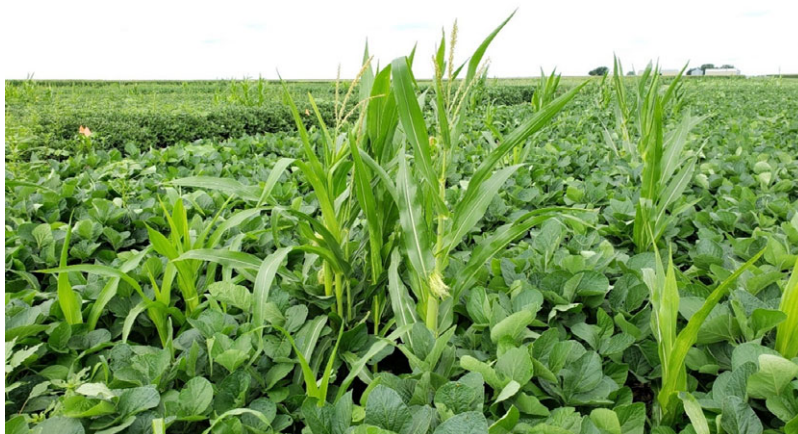
Figure 2. Soybean after corn is a typical rotation in the midwestern United States. If not controlled, volunteer corn is a problem weed in soybean fields.