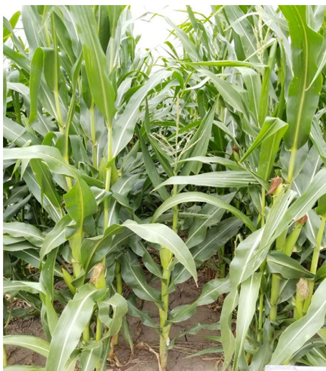
Figure 3. Volunteer corn in a cornfield in Nebraska. Highly productive soils and easy access to irrigation have encouraged growers to adopt a corn-on-corn cropping system in south-central Nebraska that results in corn volunteers.

a corn replant situation, control of GR corn was greater than 90% with paraquat ( 70 \text{ g ai ha}^{-1} ) in a mixture with a photosystem II inhibitor such as atrazine, diuron, metribuzin, or linuron before replant (Steckel et al. 2009).