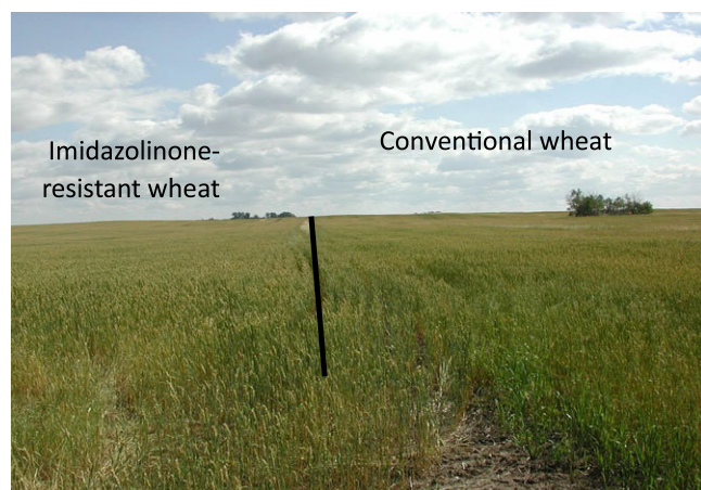
Figure 9. Field-scale evaluation of imidazolinone-resistant (Clearfield®) wheat compared with non-herbicide resistant wheat (including volunteers the following year) in Saskatchewan, Canada, in the early 2000s (adapted from Beckie et al. 2011).