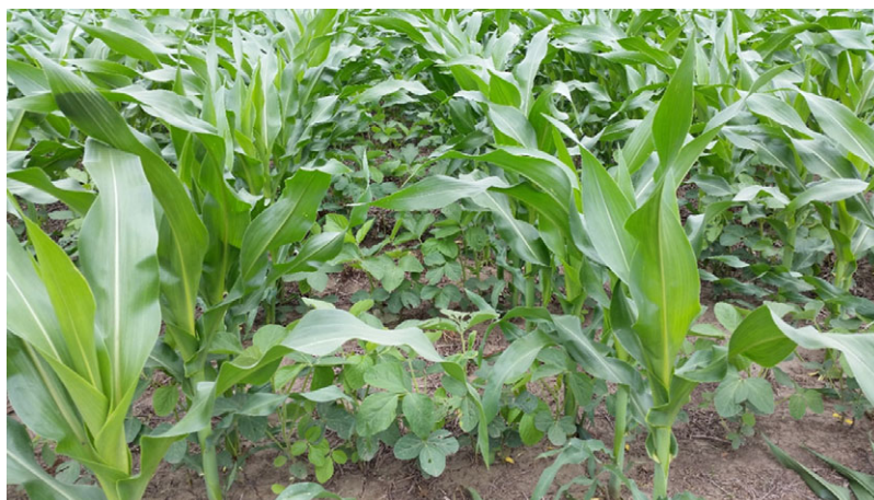
Figure 8. Volunteer soybean in a cornfield in Nebraska.

2009 (Fernandez-Cornejo et al. 2016) and 98.5% in 2013 (ISAAA 2014).