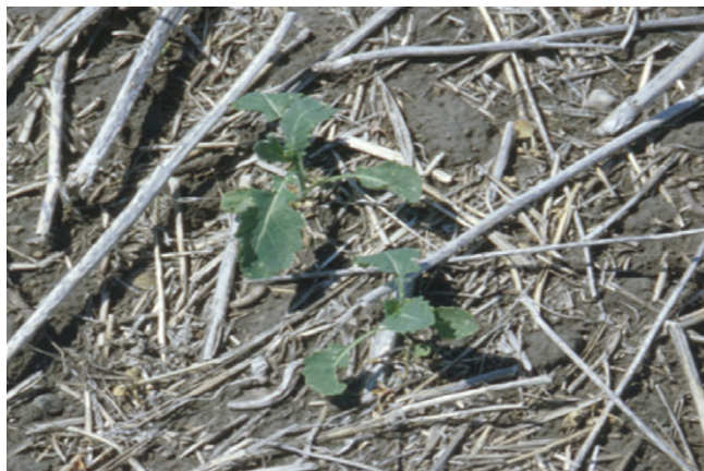
Figure 1. Glyphosate- and glufosinate-resistant canola volunteers in adjacent fields in Saskatchewan, Canada, due to bidirectional pollen-mediated gene flow the previous year.

(e.g., drought, salinity) have potential for greater weediness, persistence, and invasiveness in ruderal areas (Beckie et al. 2010).