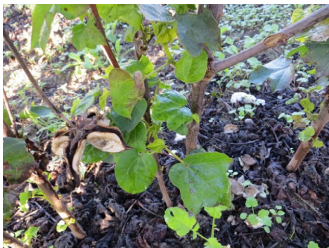
Figure 5. Cotton stalk regrowth in a field in Georgia.

observed a cotton density of 5.25 plants m^{-1} row would have to interfere with soybean for at least 6 wk following emergence before yield reduction of less than 1% would be expected. The critical need to control cotton volunteers is actually driven by boll weevil ( Anthonomus grandis Boem.) and cotton diseases such as the newly identified cotton leafroll dwarf virus disease (Bag et al. 2019; Francischini et al. 2019; Greenberg et al. 2007).