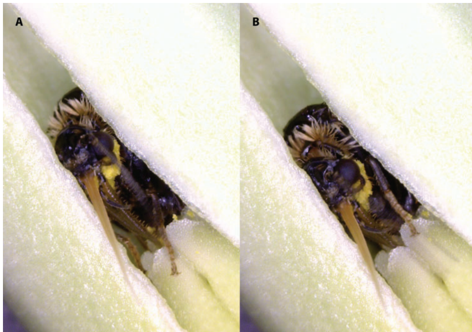
Fig. 3. A female yucca moth ( T. antithetica ) pollinating a Joshua tree ( Y. jaegeriana ). Four petals have been removed from the flower to allow a view into the corolla tube. (A) The moth extends her tentacles with some pollen near the ends toward and into the stigma, with proboscis extended. (B) The moth quickly lowers her head, pushing her tentacles into the stigma, and then raises it again. The moth's forelegs rub against the tentacles throughout the process.

since the previous pollination event (linear regression, df = 1 and 7 , R^2 = 0.3802 , F = 591 , P = 0.0454 ). That is, longer pollination events were associated with longer periods of time between pollinations.