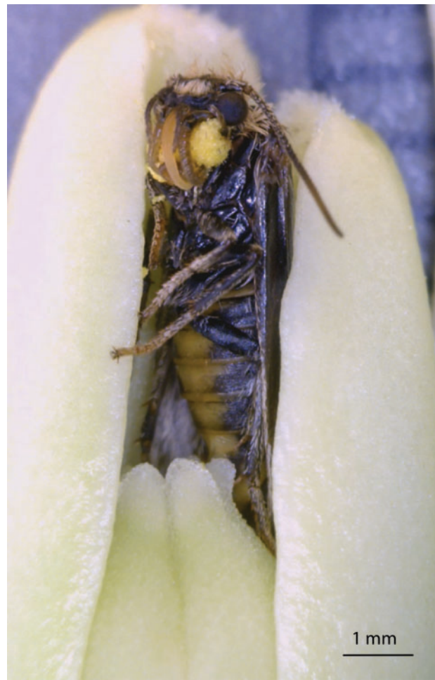
Fig. 2. A female yucca moth ( T. antithetica ) ovipositing on a Joshua tree ( Y. jaegeriana ). Four petals have been removed from the flower to allow a view into the corolla tube. The top of the pistil and the stigma are visible in the lower half of the photo. The moth's metathoracic legs are placed at the top of the pistil, and the tip of the abdomen extends behind the stigma. The moth's tentacles are visible on either side of her proboscis, coiled around a pollen load.

We observed 14 moths' complete oviposition. Moths positioned themselves with the posterior end of the abdomen aligned with the stigma, using their metathoracic legs to brace themselves against the top of the pistil, and their pro- and mesothoracic legs to press against the petals (Fig. 2; Supplementary Video 1 [online only]). While in this position, the moths rhythmically wagged their abdomens in the dorsal–ventral plane. In most cases the floral style obscured our view of the point of oviposition, but in one case we were able to cut a small window into the petal, allowing us to observe the insertion of the ovipositor. The moth used her ovipositor to probe along a groove between carpels, just below the stigma. She then punctured the style wall and pushed her ovipositor into the style using a combination of abdominal movement and extension of the ovipositor. She then retracted her ovipositor from the style wall, leaving the oviduct threaded through the hole in the style. The moth extended and retracted her ovipositor periodically, and rhythmically thrust her abdomen with the oviduct still in the style.