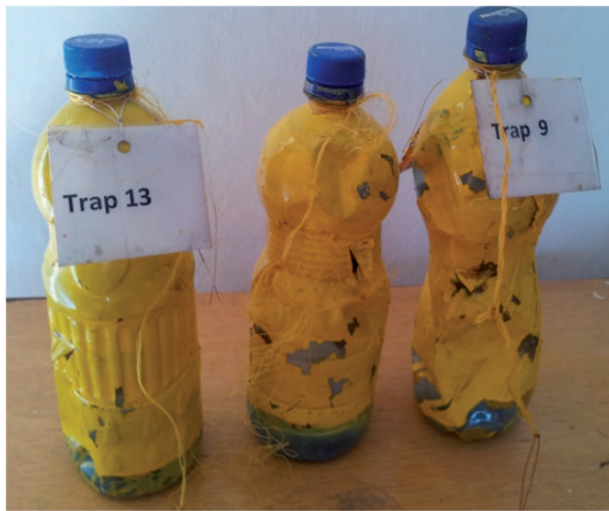
Fig. 1. Locally made fruit flies traps (donated by Arba Minch Plant Health Clinic).