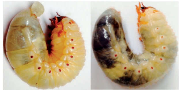
Fig. 1. Comparison of a diseased larva with viral infection (left) and a healthy larva (right). Diseased larva appears beige and milky, and its rectum is prolapsed. The abdomen of the diseased larva swells up, and the body is very soft.

The viral DNA fragment amplified by AdV-F1/R1, -F2/R2, and -F3/R3 was isolated from agarose gel, and DNA sequences were determined with an Applied Biosystems 3730xl DNA Analyzer (MacroGen, Seoul, Korea). Blast search with OrNV genome (NC_011588) revealed that the three sequences have 98%, 98%, and 99% identical to corresponding OrNV genes, respectively.