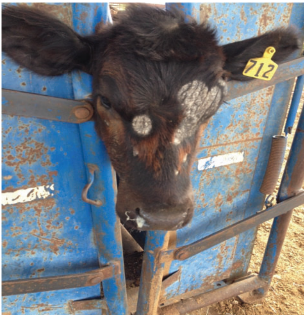
Fig. 1. Angus calf infected with bovine ringworm at the study site (Edinburg, TX).

Flies were collected on two separate occasions (05 June and 17 June 2014) from Angus cattle diagnosed with bovine ringworm. Cattle were stanchioned to ease fly collection using aerial nets to gather flies swarming around the faces of those infected. Flies were collected from one calf per collection date, with a total of two calves sampled. The flies that were collected were enumerated and individually stored (1 fly per 10 ml sterile vial) at -20^{\circ}\text{C} until processed. Two easily distinguished species were collected: house flies and horn flies, Haematobia irritans (L.), the latter of which were discarded.