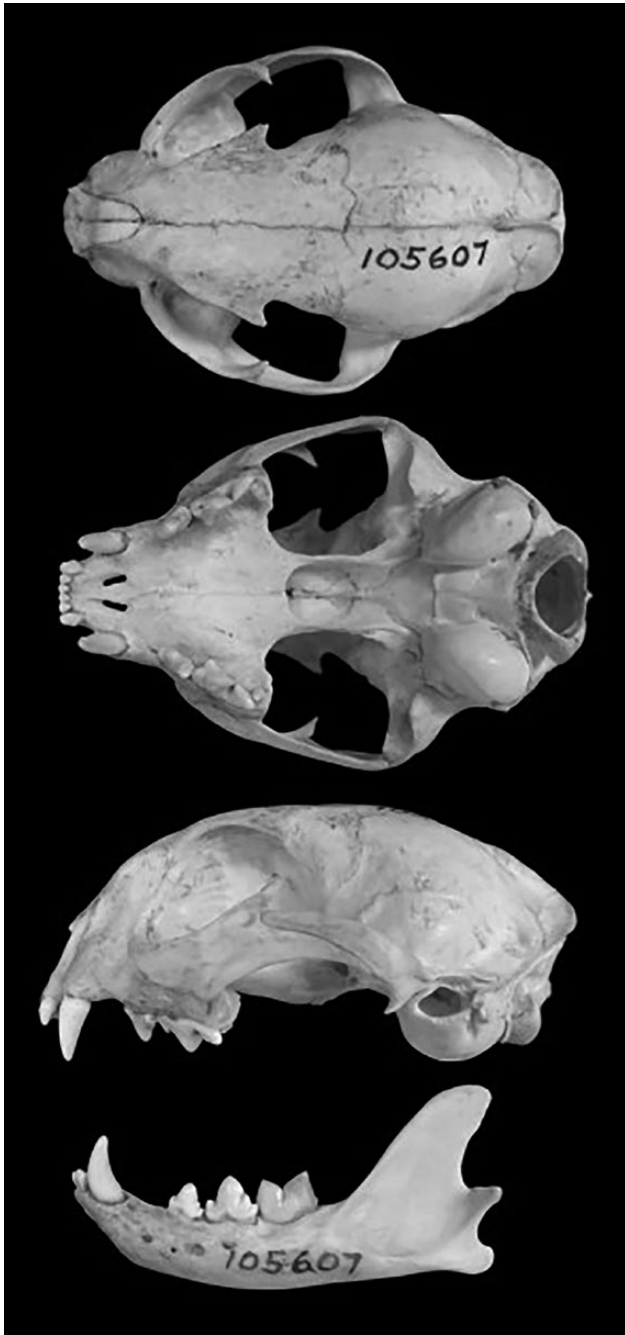
Fig. 3. —Dorsal, ventral, and lateral views of skull and lateral view of mandible of an adult female Caracal caracal (FMNH [Field Museum of Natural History] 105607) collected by H. H. Hoogstraal (collector # 13919) on 9 December 1972 at Africa, Sudan, Kassala, Ethiopian: Kassala, Abu Gamal. Total skull length is 103.52 mm. f8e611ef-14e0-431f-acd8-8955c8521c97 Field Museum of Natural History (Zoology) Mammal Collection. https://collections-zoology.fieldmuseum.org/catalogue/2604376 .

2010). Females likely do not begin mating until 14 months of age and can remain reproductive until 18 years of age (Furstenburg 2010). Females are polyestrous and estrus cycles last anywhere from 1 to 6 days (Nowell and Jackson 1996).