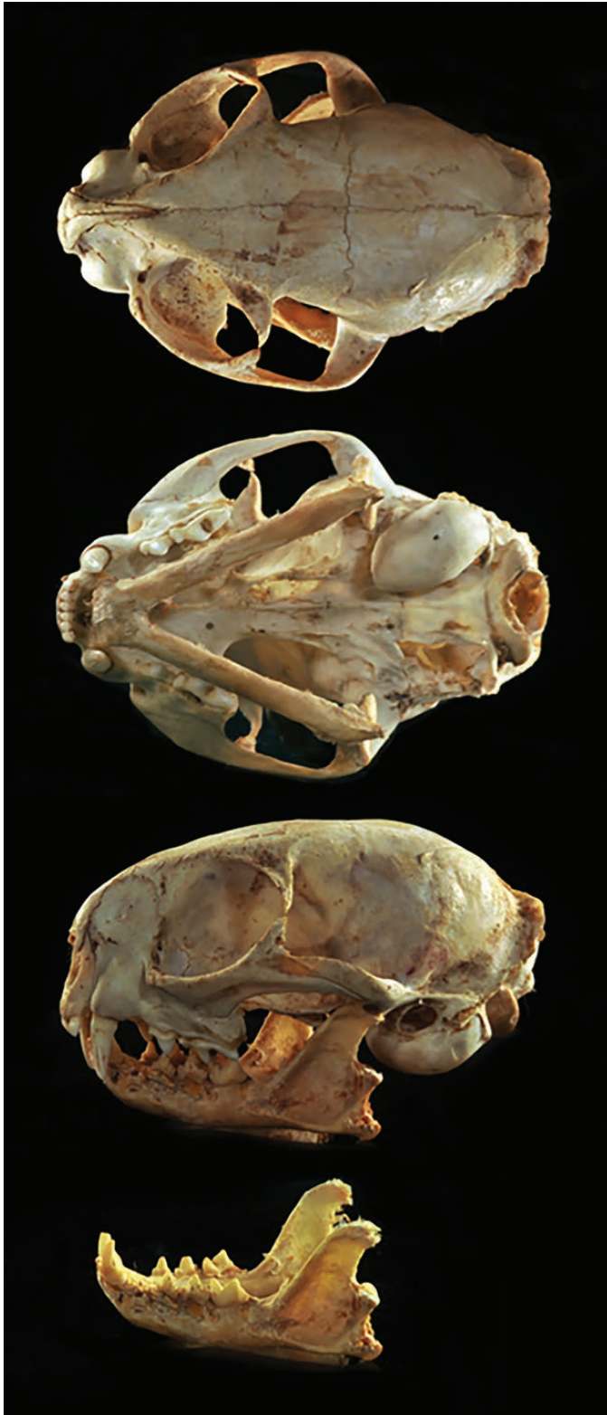
Fig. 2. —Dorsal, ventral, and lateral views of skull and lateral view of mandible of a female Prionailurus rubiginosus (Sri Lanka National Museum of Natural History registration number 38) from Katagamuwa southern province, 5.09.1933. Greatest length of skull is 61 mm.