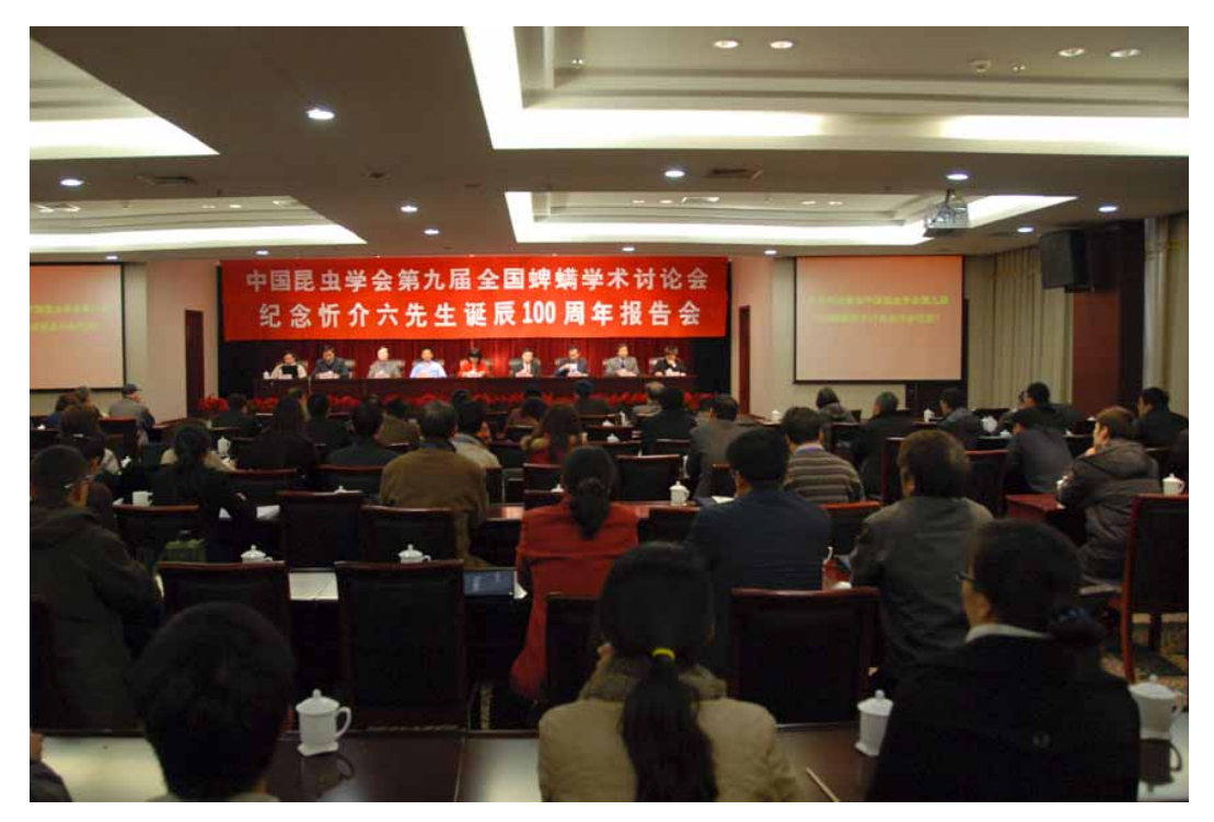
FIGURE 2. The opening session of the Symposium Commemorating the Centenary of Prof Jie-Liu Xin's Birth during the 9th National Congress of Acarology organized by the Entomological Society of China (Nanjing Agricultural University, 28 Nov. 2009).