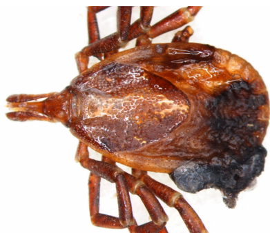
FIGURE 1. Dorsal view of adult A. longirostre female found in Oklahoma, note the elongated scutum.

On 24 September 2005, a homeowner discovered a large, odd looking tick crawling on a propane tank in Pittsburg County, south of Hartshorne, Oklahoma. The tick was collected, brought to the Pittsburg County Oklahoma Cooperative Extension Service office where it was sent by mail to the Plant Disease and Insect Diagnostic Lab (PDIDL) in the Department of Entomology and Plant Pathology at Oklahoma State University. The tick was identified on 3 October 2005 using an established key (Jones et al. 1972) (Figs 1, 2) as an adult female A. longirostre and given an ascension number (#200501316). It was later verified using detailed descriptions by Voltzit (2007).