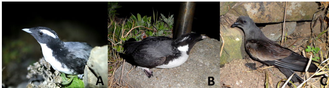
FIGURE 2. Three avian hosts of Ornithodoros sawaii : (A) Japanese Murrelet ( Synthliboramphus wumizusume ), (B) Ancient Murrelet ( Synthliboramphus antiquus ), and (C) Swinhoe's Storm Petrel ( Hydrobates monorhis ).

et al. (2003). PCR assays were performed using 50 \mu L of reaction mixture with TaKaRa ExTaq™ DNA polymerase (Takara, Shiga, Japan) at 94°C for 5 min, followed by 35 cycles for 10 sec at 94°C, 30 sec at 55°C, and then 30 sec at 72°C, with a final extension step of 5 min at 72°C. PCR products were then purified using a QIAquick® Gel Extraction Kit (Qiagen, Hilden, Germany) according to the manufacturer's instructions and sequenced after cloning into pCR®4-TOPO® plasmid (Invitrogen, Carlsbad, USA), using ABI Prism BigDye™ Terminator v3.1 Cycle Sequencing Kits and an ABI 3730xl sequencer (Applied Biosystems®, Foster City, USA) at MacroGen, Inc. (Daejeon, ROK). Sequencing results were assembled using the SeqMan program implemented in DNASTAR software (version 5.0.6; DNASTAR, Inc., Madison, WI, USA) to determine consensus sequences. The mt-rrs sequences of ticks identified in this study have been deposited in GenBank under accession numbers KY654988-KY655001.