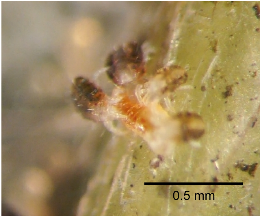
FIGURE 2. Four immature individuals [2 larvae (right) and 2 nymphs (left)] attacking midge larva.