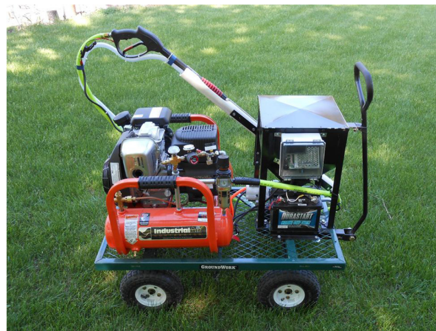
Fig. 1. Portable abrasive grit applicator showing the air compressor, grit tank, battery-powered auger, air and grit hoses, and trigger-operated single-nozzle wand. [Colour online.]

students at South Dakota State University as part of their senior design project. The applicator consisted of a small gasoline-powered air compressor, a grit tank with a motorized auger, a 12-volt battery, a hand-held wand tipped with a single cone-type nozzle, and two sets of flexible tubes that separately connected the auger to the nozzle and the compressor to the nozzle. The wand had a biphasic trigger that opened air flow to the nozzle first and secondly grit flow to the nozzle. The battery powered a small motor that governed auger speed (i.e., the “duty cycle”). With air pressure set at 800 kPa (116 psi) and the duty cycle set at 50 rpm, the delivery rate of corncob grit was 6.6 \pm 0.35 \text{ g s}^{-1} ( N = 3 ), which affected a circular area with a 5 cm diameter at a 50 cm distance. (All settings and rates were determined through a series of preliminary trials.)