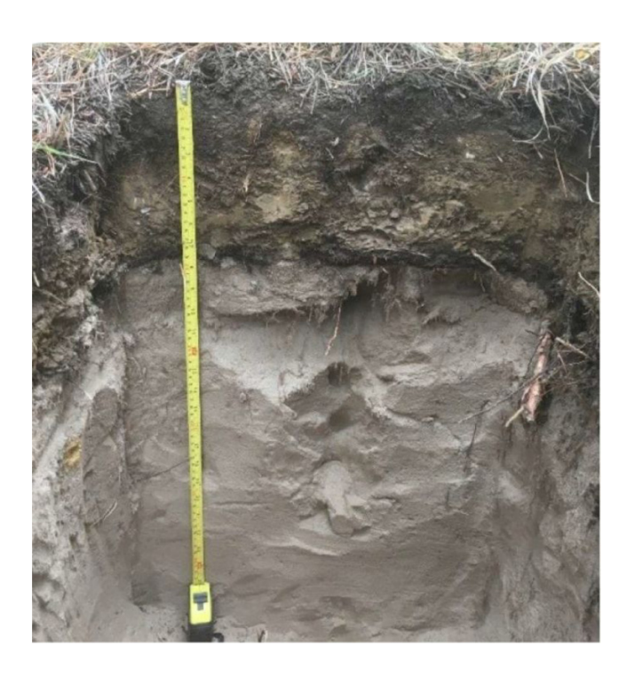
Fig. A2.