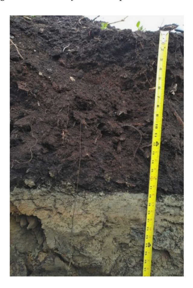
Fig. A4.