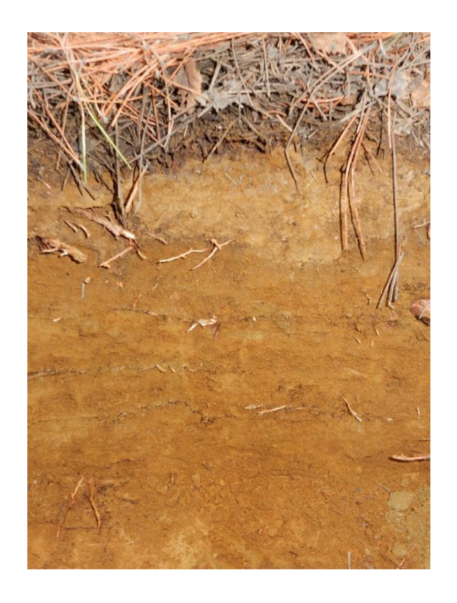
Fig. A3.