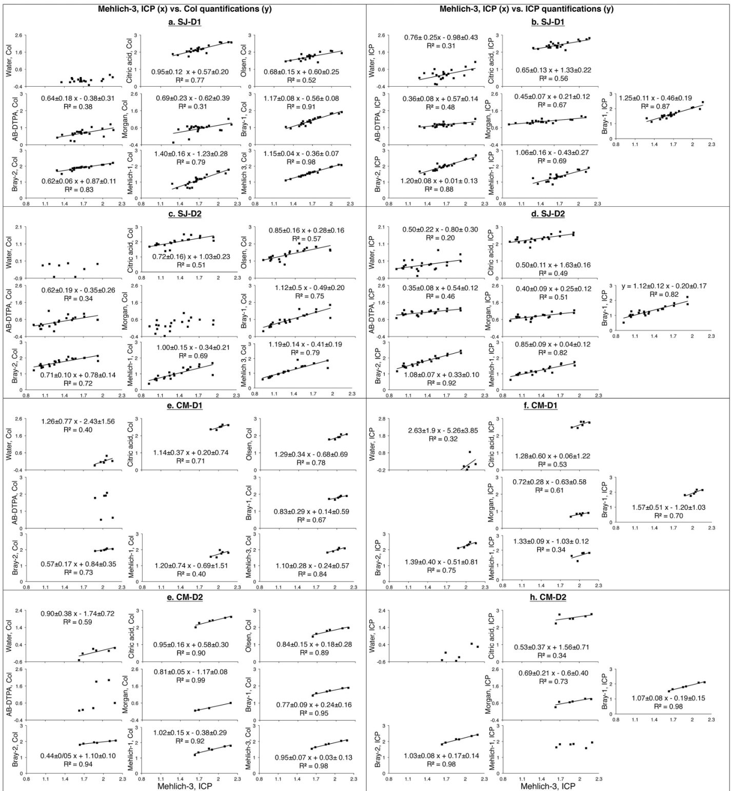
Fig. 3. Linear regression model established between P-M3 ICP and other P-tests analyzed by colorimetry (a, c, e, g) or ICP (b, d, f, h) for managed soil groups collected from 0 to 20 cm (SJ), 20 to 40 cm (SJ), 0 to 10 cm (CR), and 10 to 20 cm (CR), respectively; log-transformed data set; equations with nonsignificant slopes (i.e., not different from zero) are not presented; P-tests with less than five samples were excluded. CR, Cormack; ICP, inductively coupled plasma; SJ, St. John's Research and Development Centre of Agriculture and Agri-Food Canada.