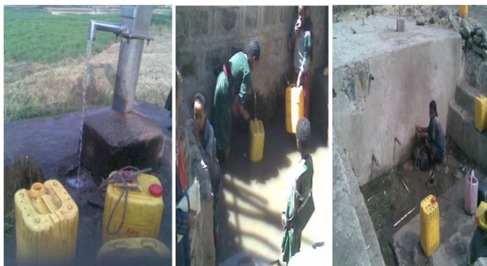
Figure 2. Status of improved water sources, and poorly managed (backflow, flooding, and broken).

tap water other sources indicates the incidence of fecal and total coliforms (14.3%). Whereas, 42.8% and 42.9% of the improved sources are under intermediate and high-risk classification. The two urban sources (Ur1 and Ur2) are included under the low-risk classification. Table 2 summarizes improved and unimproved water sources for total and fecal coliforms.